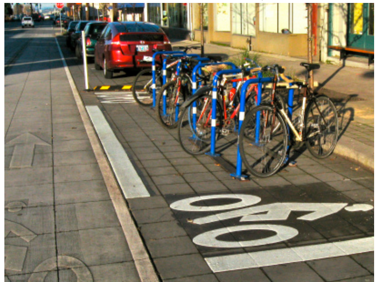
FIGURE 14: BIKE CORRAL, PORTLAND, OREGON