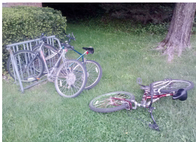
FIGURE 5: NORTH BENNINGTON

This is a good example of bike parking offered in Manchester Center