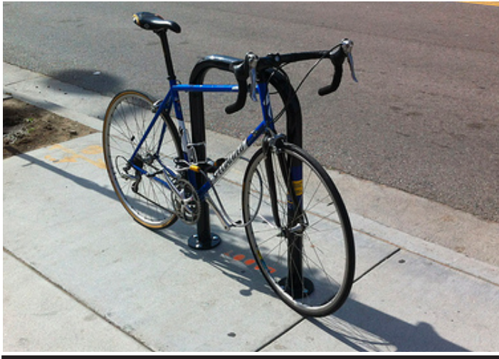
FIGURE 7: TYPICAL U-RACK This image shows a U-Rack that has been properly installed, parallel to the street.

The most common type of small rack is the U-rack (or hoop rack), which should be installed parallel to the street and sidewalk in the same vicinity as landscaping, street furniture and utilities, and can hold two bikes securely upright by the frame and a wheel without obstructing the pedestrian right-of-way.