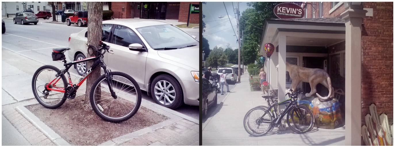
FIGURE 2: LACK OF BIKE PARKING IN BENNINGTON

Although cycling has long been a popular activity for many Bennington County residents, many areas within the county lack proper infrastructure to support bicycles; specifically noticeable is a lack of formal bike parking. To encourage the use of bicycling as a means of daily transportation, more and better bike parking is needed. While there are some bicycle racks in the area, many are poorly placed or designed, and cyclists have consistently been seen avoiding these racks rather than risk damaging their bike or leaving it insecurely fastened, and resort to using other more convenient fixtures such as street signs or trees. This can lead to damage of property, both personal and municipal, and be a nuisance to other users and pedestrians.