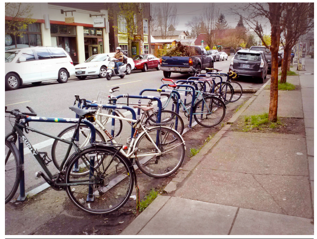
FIGURE 19: PORTLAND, OR

Like many other places in Vermont, Bennington County has great potential for bicycling.