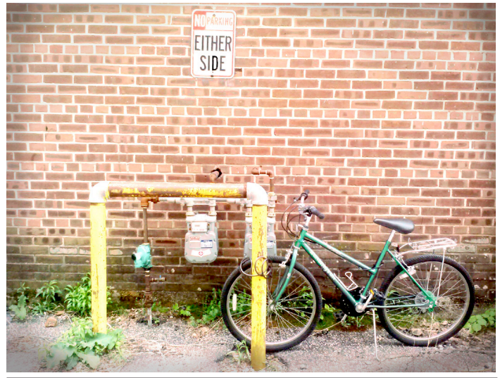
FIGURE 10: BENNINGTON Although minimum vehicular parking requirements in the county are strictly mandated, bike parking is not, leaving cyclists such as this one to fend for themselves in leftover space not claimed by vehicular parking.

Just as town zoning regulations define the minimum amount of car parking spaces required for different establishments they should specify the requirement for bicycle parking. For example, the Town of Bennington’s Development and Land Use Regulations, similar the rest of the county in this way, mandate strict minimums for vehicular parking but have no mandate for bicycle parking.