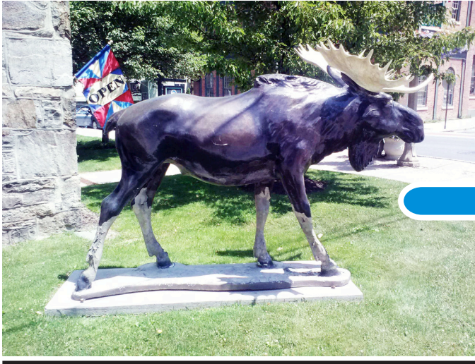
FIGURE 15: MOOSEFEST A Moose Statue on display as part of Bennington's Moosefest.

Local businesses should be encouraged to install custom art racks to personalize and enhance their aesthetic quality. Partnering with local businesses, the Chamber of Commerce and other organizations, towns could promote street art fundraisers to create unique attractions such as the Moosefest and Catamount Prowl sculptures in the Town of Bennington.