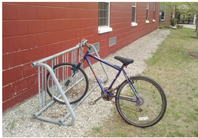
FIGURE 3: ARLINGTON HIGH SCHOOL

As town planning encourages the development of bicycling in towns and villages with improved infrastructure (e.g., lanes, multi-use paths), bicycle parking should also be considered. Popular outdoors and recreational destinations such as Arlington’s Recreation Park, Howard Park in South Shaftsbury, Dana Thompson Recreation Park between Dorset and Manchester, as well as historic buildings and country stores are all popular places for both local and visiting cyclists.