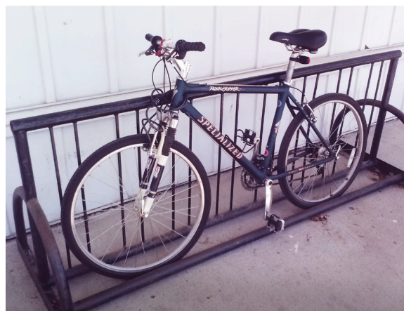
FIGURE 6: BENNINGTON

A cyclist used this entire rack, located in downtown Bennington, because they wanted double support for their bike.