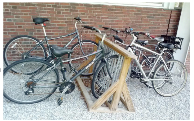
FIGURE 17: BENNINGTON COLLEGE

Working in tandem with schools, colleges and other organizations, communities should raise awareness of bicycling destinations in Bennington County. For example, Bennington College has a bike-share program providing students with a means of transportation off campus. Having more bike parking at nearby destinations could significantly increase students' involvement in the local and regional economy.