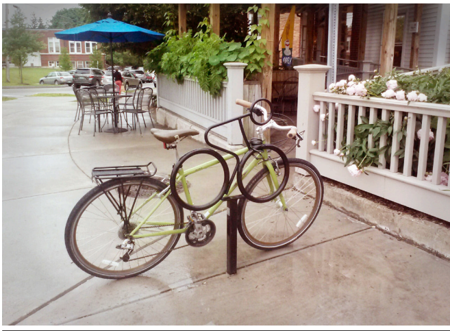
FIGURE 18: MIDDLEBURY, VT

www.changelabsolutions.org/bike-policies