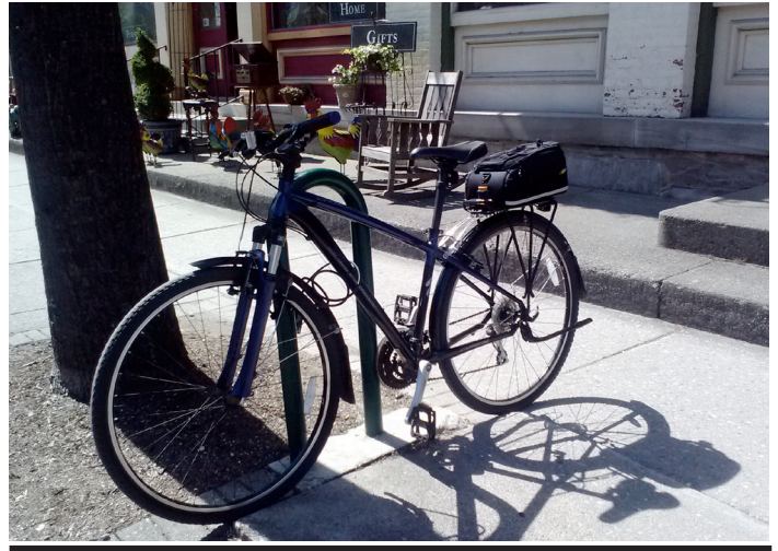
FIGURE 8: BENNINGTON U-RACK This U-Rack, located in downtown Bennington, is improperly installed and impedes the pedestrian walkway.