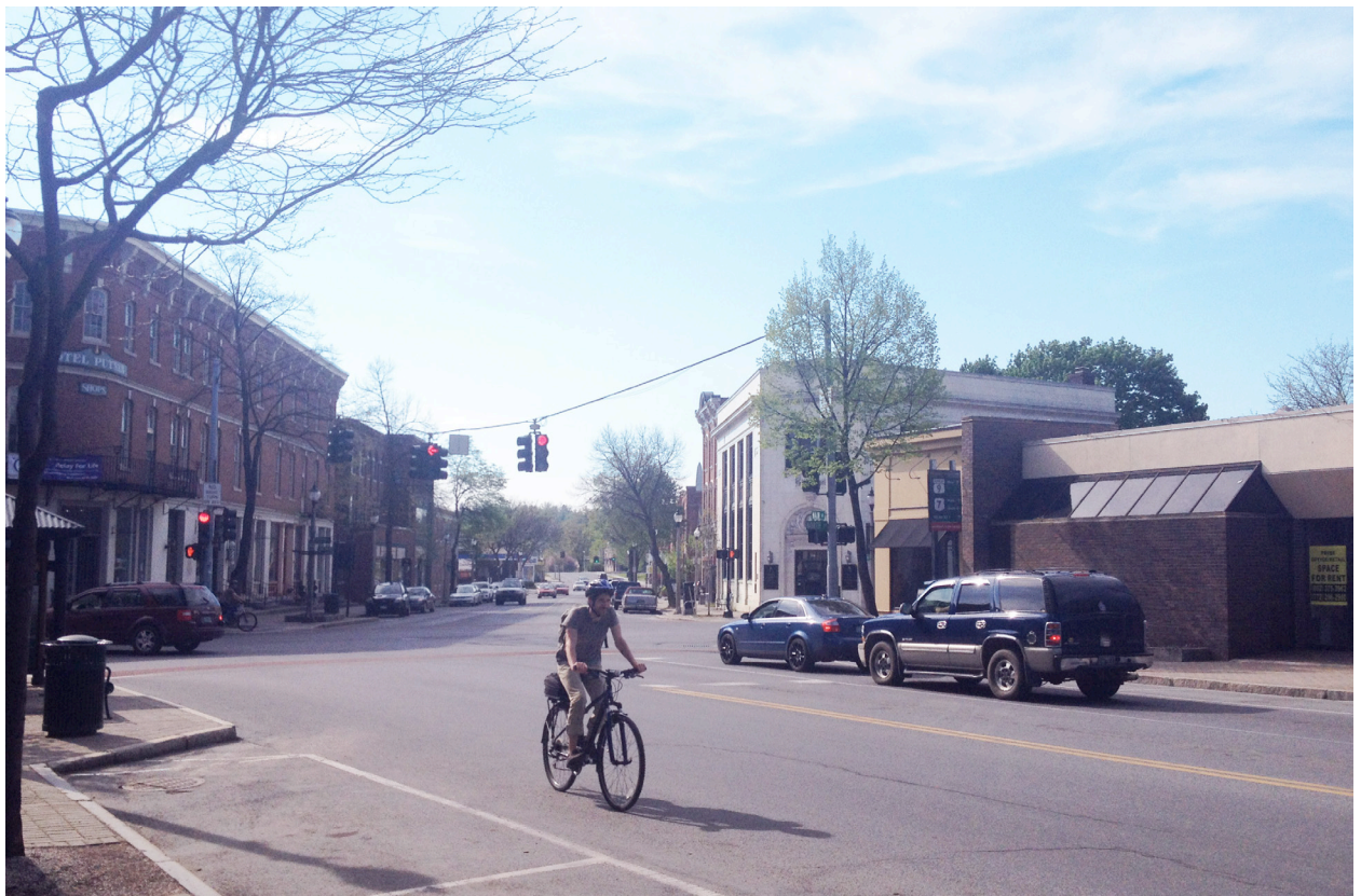
FIGURE 1: A CYCLIST IN DOWNTOWN BENNINGTON