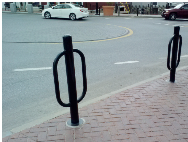
FIGURE 4: MANCHESTER

This rack offers students a place to lock bikes during school, but lacks cover.