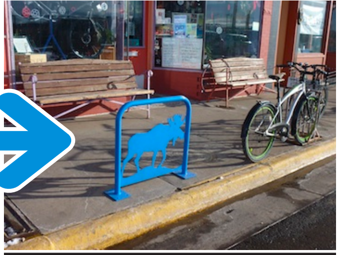
FIGURE 16: MOOSE RACK Like Bennington's Moosefest, bike racks can be artistic and practical. This rack was done by an artist competition in Laramie, Wyoming.