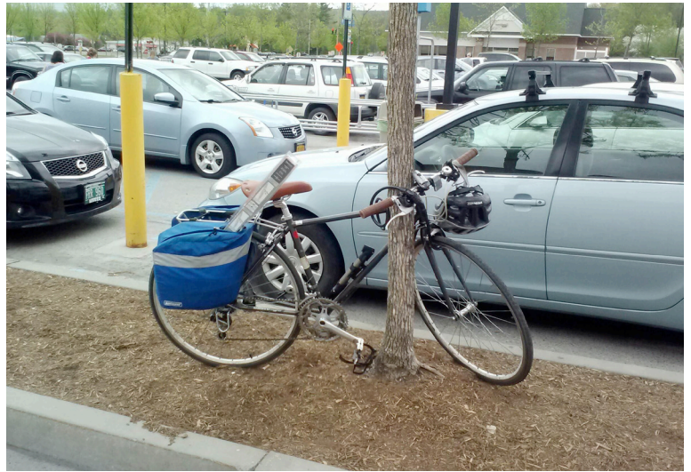
FIGURE 13: WALMART, BENNINGTON