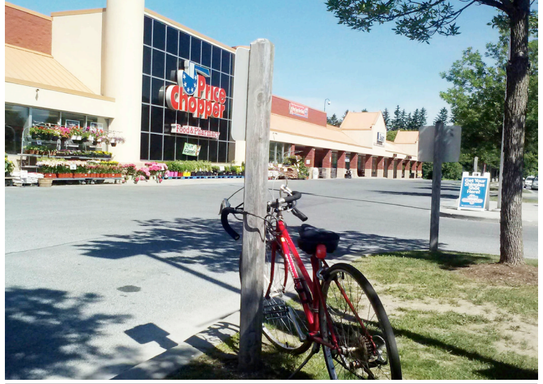
FIGURE 12: PRICE CHOPPER, BENNINGTON