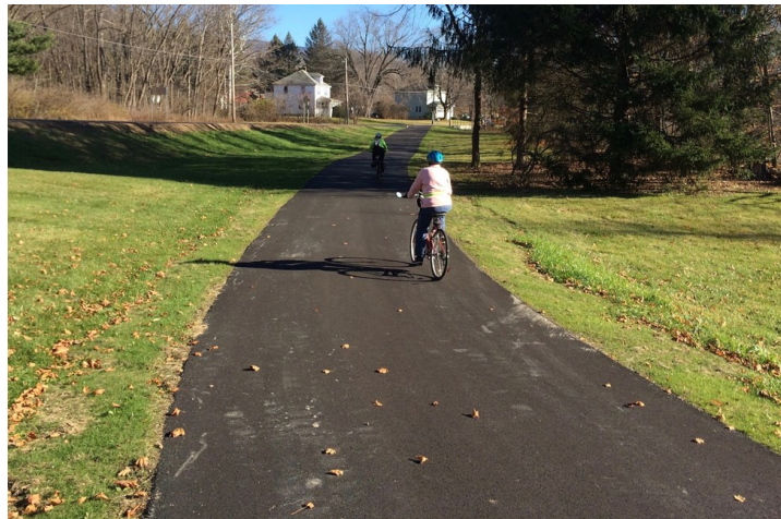
The recently constructed Ninja Bicycle Path Phase I along VT67A in Bennington

Phase II will be a primitive dirt path linking the end of the new paved path to Morse Road. This will allow path users to reach downtown Bennington without traveling on Northside Drive while Phase III, the paved path, is designed, permitted, and constructed. The Town and BCRC recently acquired all property owner permissions and permits necessary to construct Phase II, and we hope to have it open in the spring.